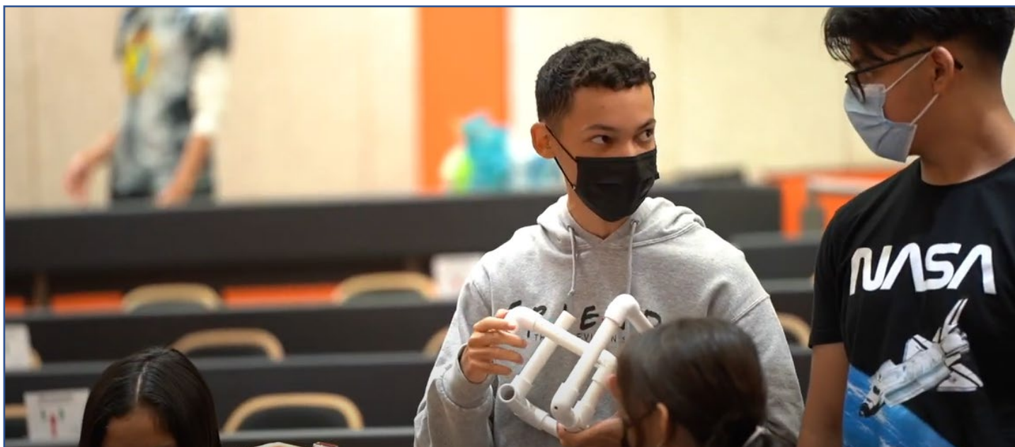
TRIO Upward Bound students at Northeastern Illinois University engaged in teaching underwater robotics, cultural experiences, and biodiversity exploration in Puerto Rico.