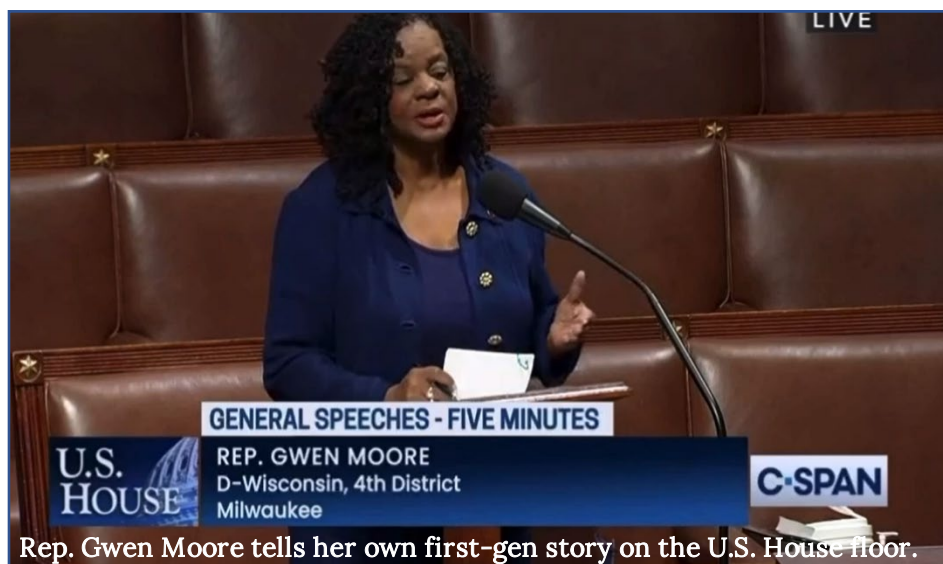
Rep. Gwen Moore tells her own first-gen story on the U.S. House floor.