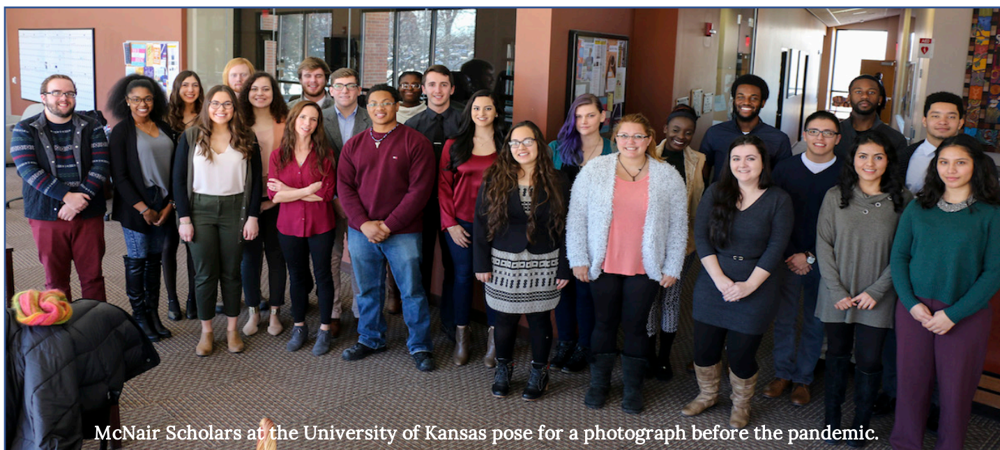
McNair Scholars at the University of Kansas pose for a photograph before the pandemic.